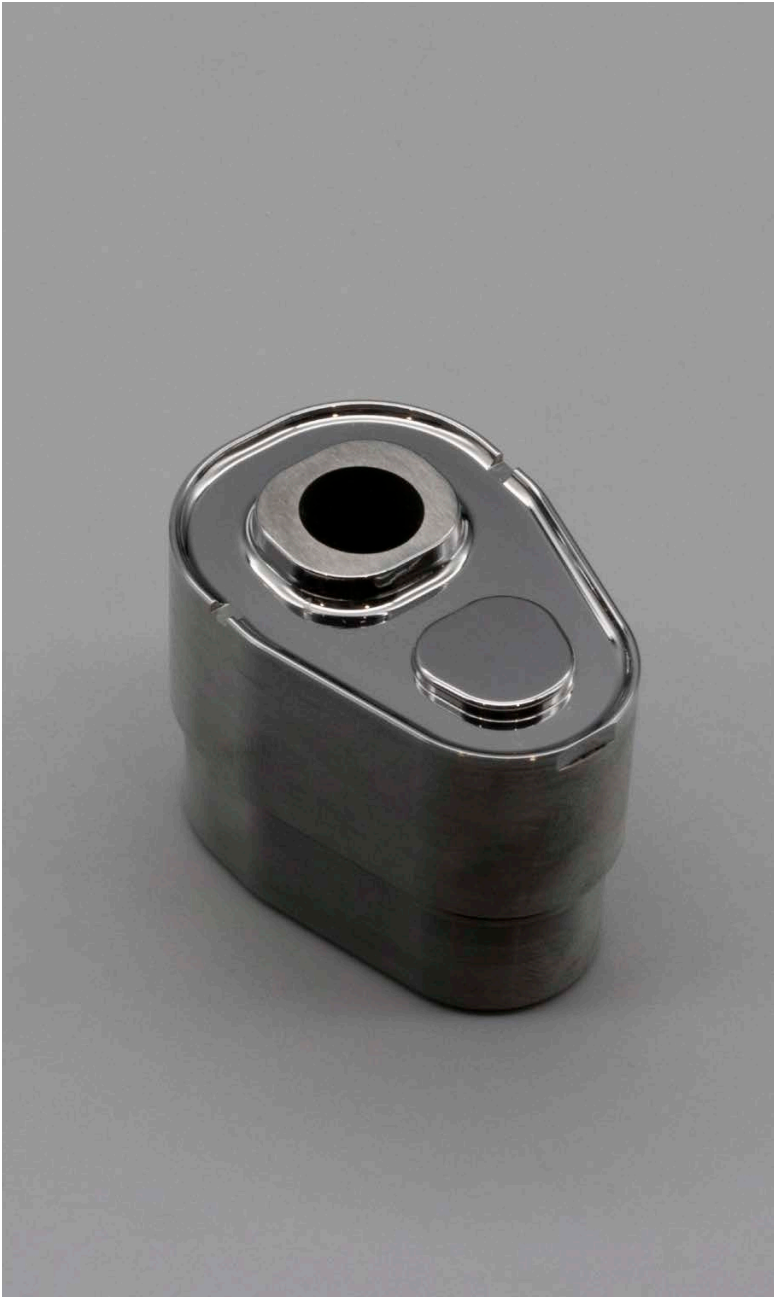
Eye made in Hard Metal