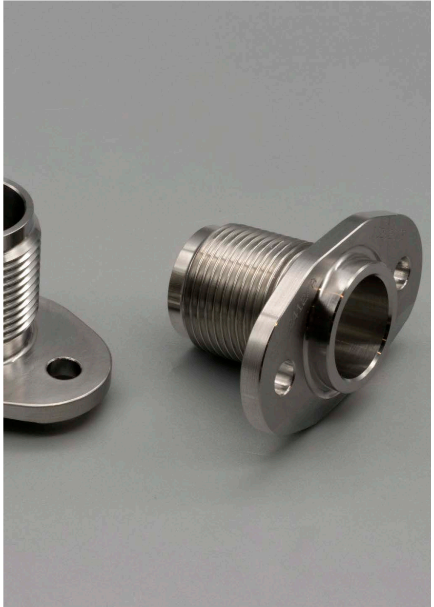
Pins for the Aeronautical Industry